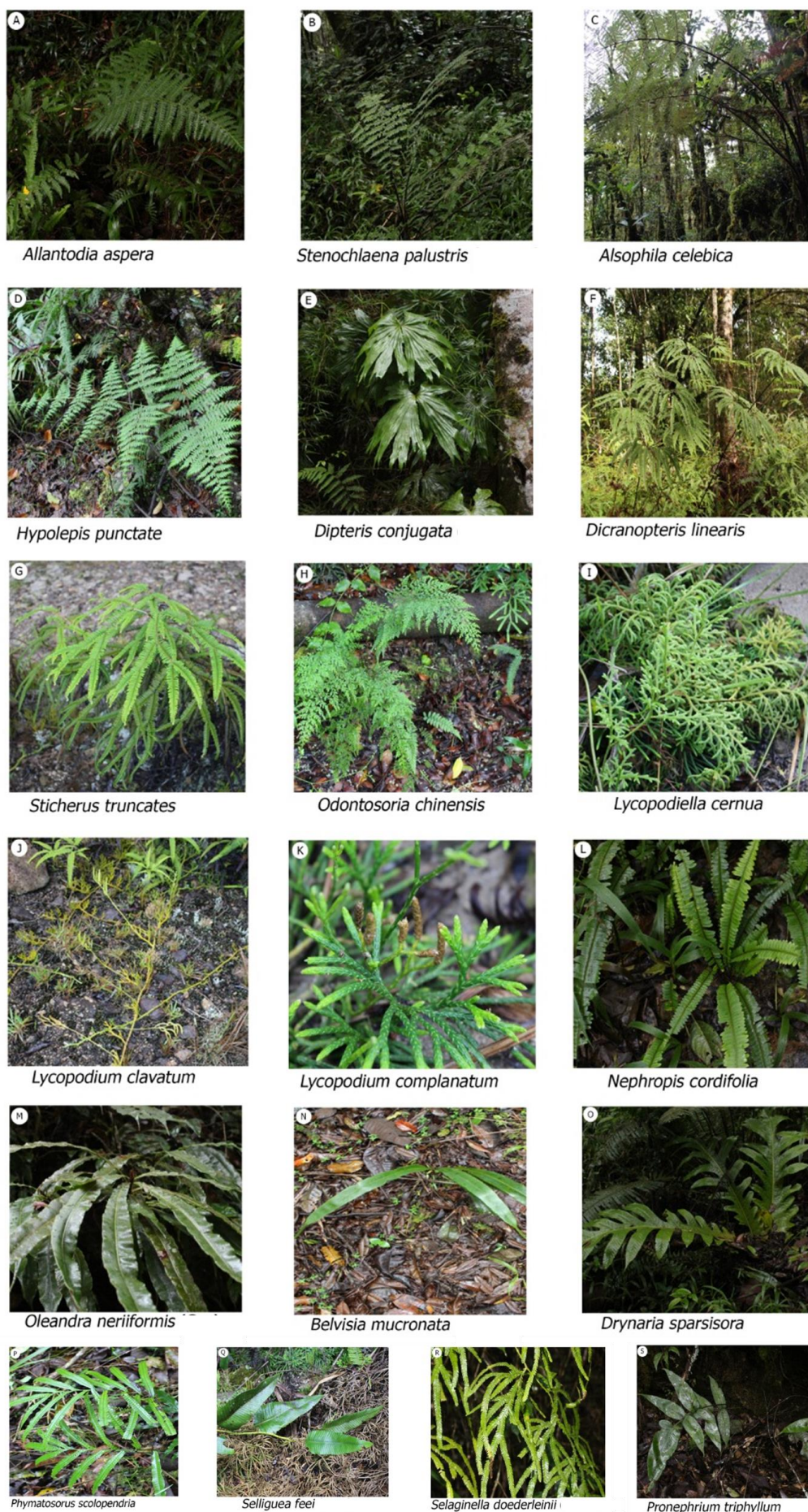
Fig 2. Diversity of terrestrial ferns in Mount of Rore Kautimbu, Lore Lindu National Park.