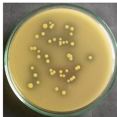
Fig 1. Clear zones of LAB isolates

Isolation of LAB on MRSA media + 0.5% CaCO 3 from 6 sawi asin samples from Bogor resulted in 66 bacterial isolates (Table 1). The LAB bacteria were indicated by formation of clear zone around bacterial colonies (Figure 1). LAB isolates on MRSA + 0.5% CaCO 3 were indicated by the presence of clear zone around bacterial colonies. After 2-3 incubation days the LAB isolates produced acid that reacted with CaCO 3 and eventually clear zone was formed because Ca-lactate in the media was dissolved (Djide & Wahyudin, 2008). Fermented mustard is a suitable source for exploring lactic acid bacteria (LAB) (Chao et al., 2009). LAB held the main role to ferment sawi asin (Puspito & Fleet, 1985).